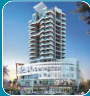
Lotus Link Square, Malad